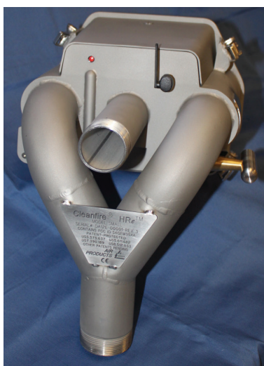
Figure 3: Air Products' Cleanfire HR e burner is the first smart burner for the glass industry.